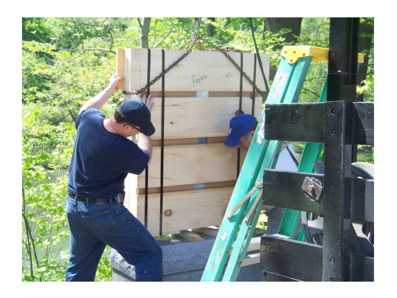
The Granite Memorial Stone arrives