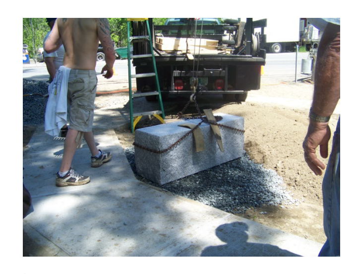
Positioning the granite benches