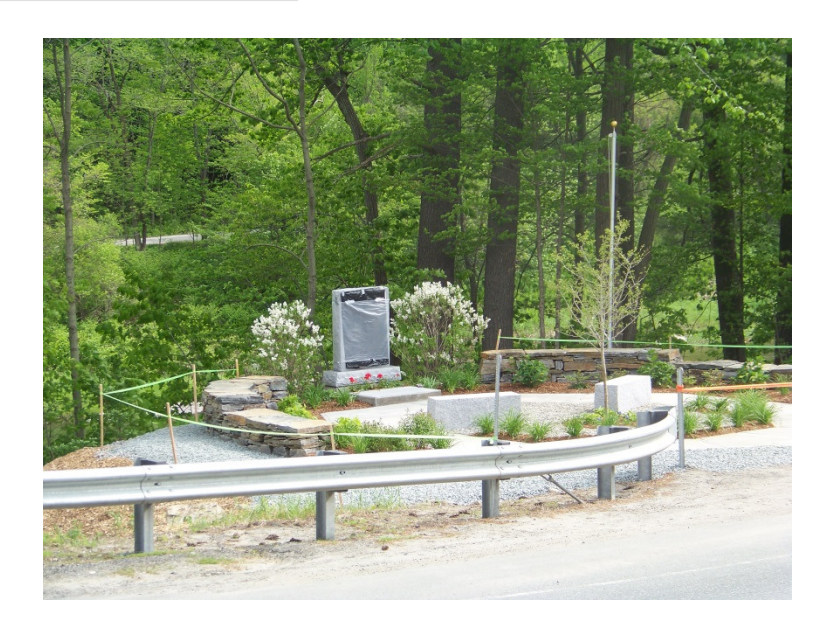
Ready for the dedication