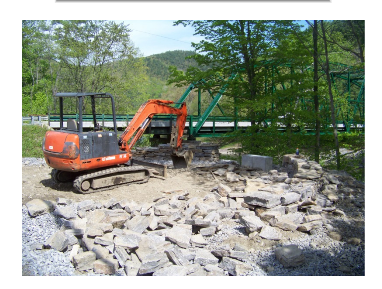
Selecting rocks for the stone wall.