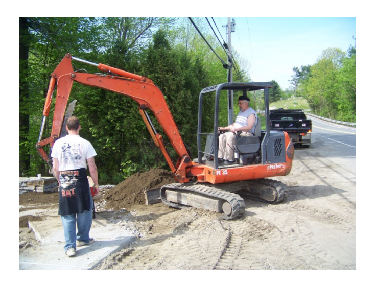
Adding the donated topsoil