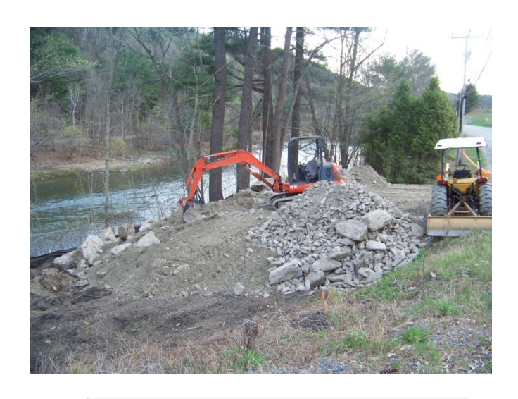
Building up the site