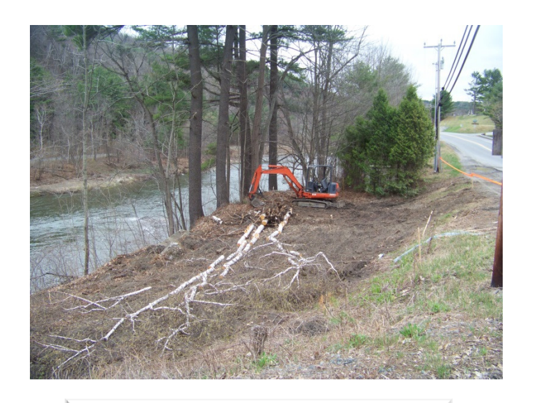
Clearing the site