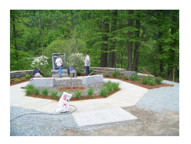
Final tweaking before the dedication